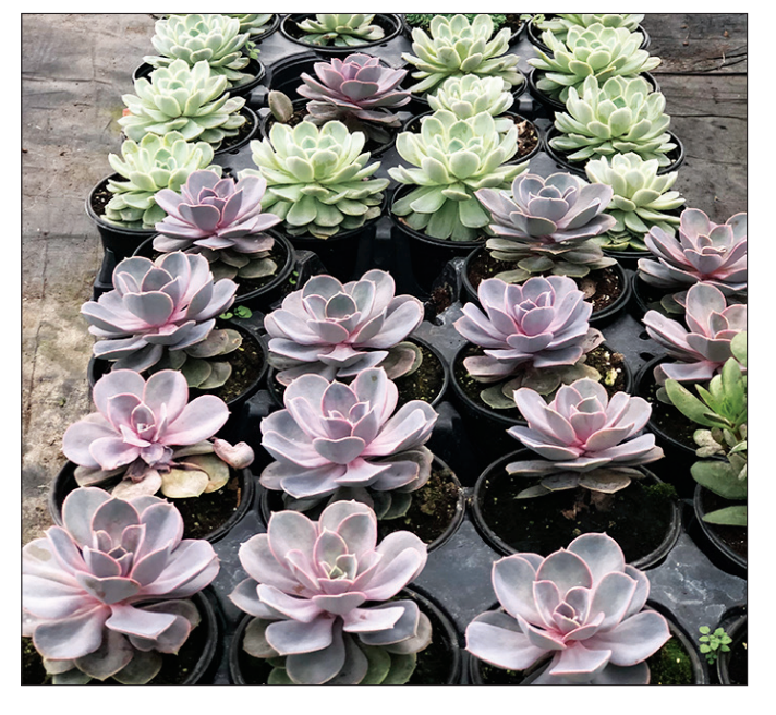
Beautiful succulents and pansies from Butler's Greenhouse