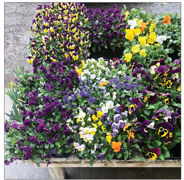
SOUTHSIDER VOICE