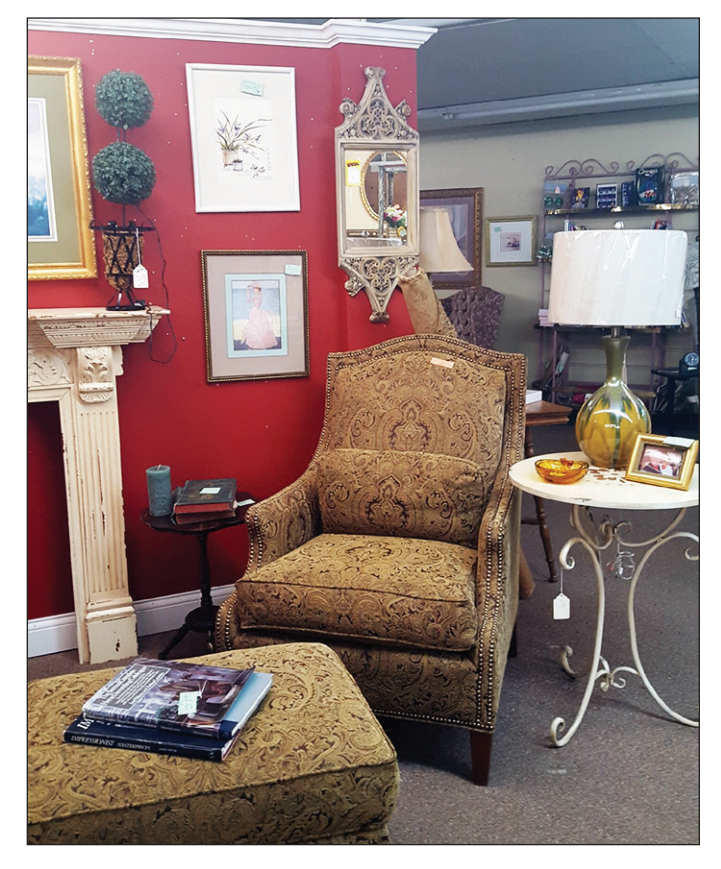
A retirement sale is underway at Karen Mercer Interiors & Other Fabulous Finds, 2220 E. Southport Road.