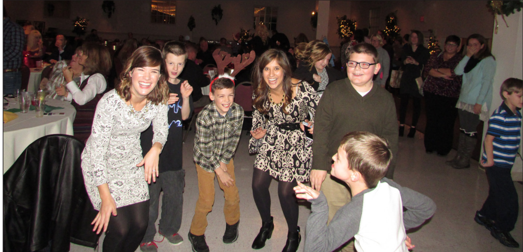
These dancers couldn't let a good song go to waste.

Applications For Registration Now Being Accepted Call 787-8277, ext. 243 or visit www.roncalli.org