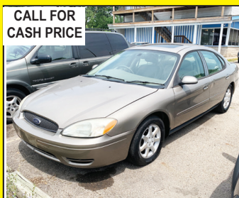
'06 FORD TAURUS Auto, full power.