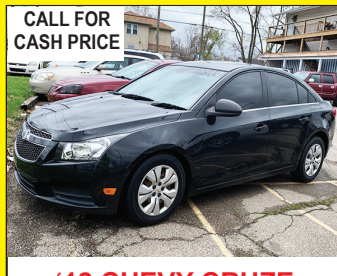
'12 CHEVY CRUZE Auto, full power.