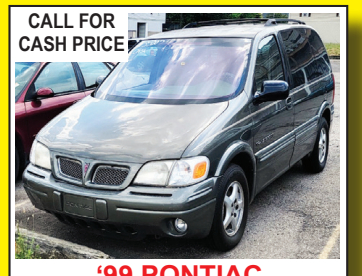
'99 PONTIAC TRANS SPORT Auto, full power.