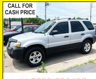
'06 FORD ESCAPE Auto, full power.