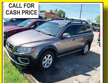
'11 VOLVO XC70 WAGON Auto, full power.