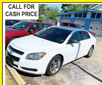
'12 CHEVY MALIBU Auto, full power.