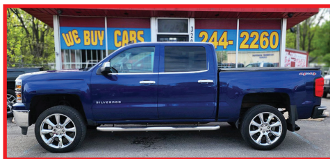
See Pages 6-8